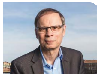
JEAN TIROLE Toulouse School of Economics